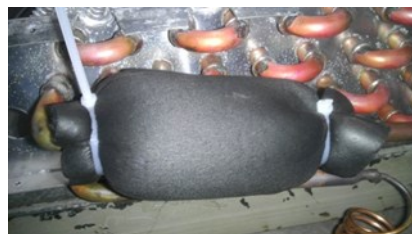
Accumulator covered with Aeroflex