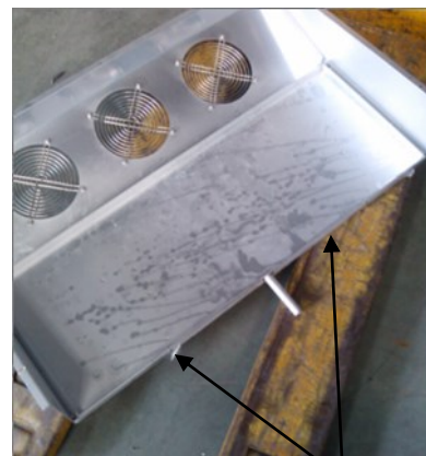
New larger drip-tray screwed to Evaporator-Cover