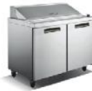
ASP1225 / ASP1555