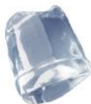
18 gr FULL ICE CUBE