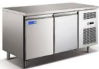
AGB30-6L2 AGB30-7L2 AFB30-7L2