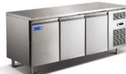
AGB50-6L3 AGB50-7L3 AFB50-7L3